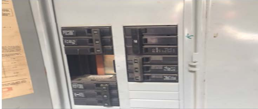
Camden County Parks Carpentry Shop Electrical Panel

An electrical panel in the Carpentry Shop was observed with unused openings which present a potential hazard, contrary to the standards established in 29 CFR 1910.305(b)(1)(ii).