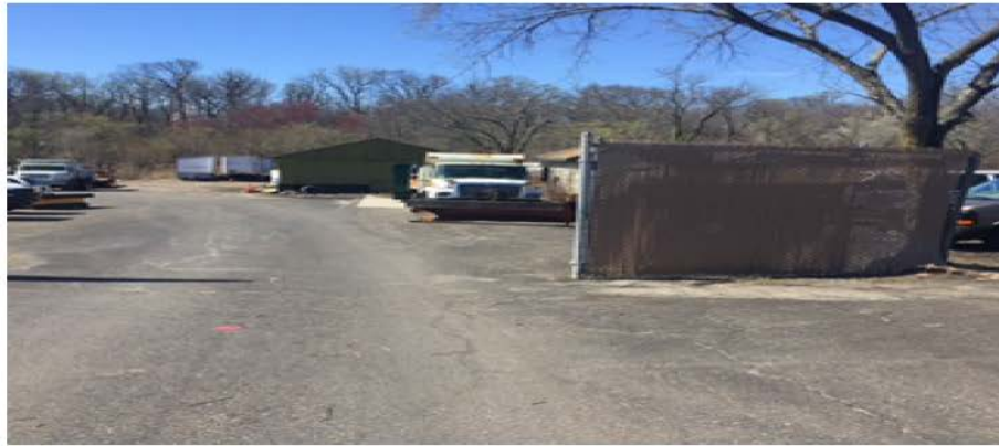
Camden County Parks Department Yard Entrance